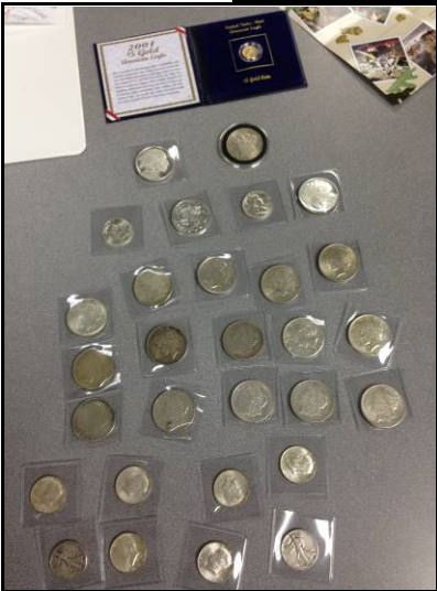
Tonights Raffle Prizes