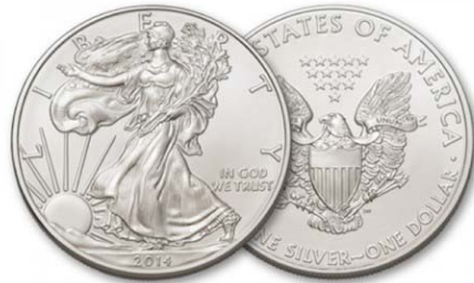
1 oz. Silver Eagles (5)