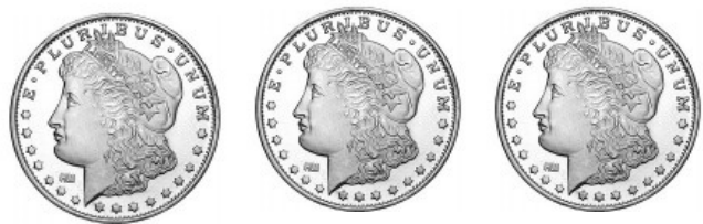
½ oz. Silver Rounds (7)