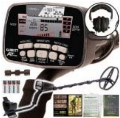
Garrett AT Pro Metal Detector & Headphones