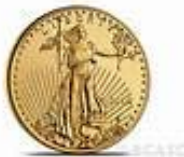
1/10 oz. Gold Eagle