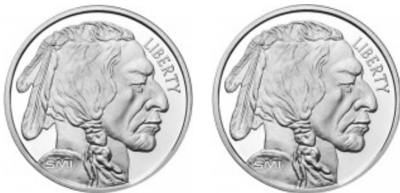
1 oz. Silver Rounds (5)