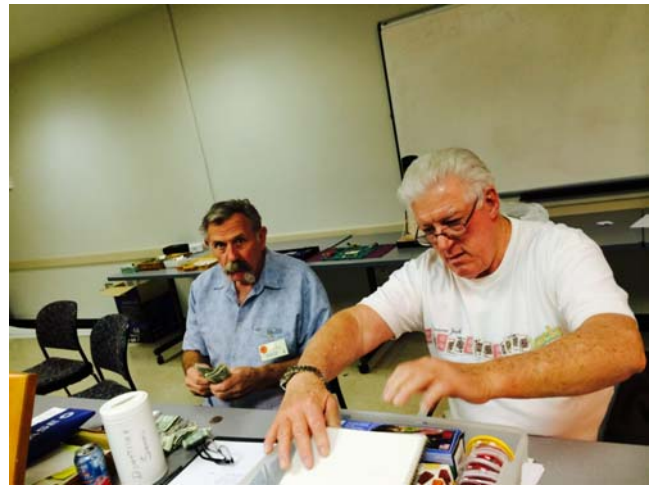
The Brains of the Outfit