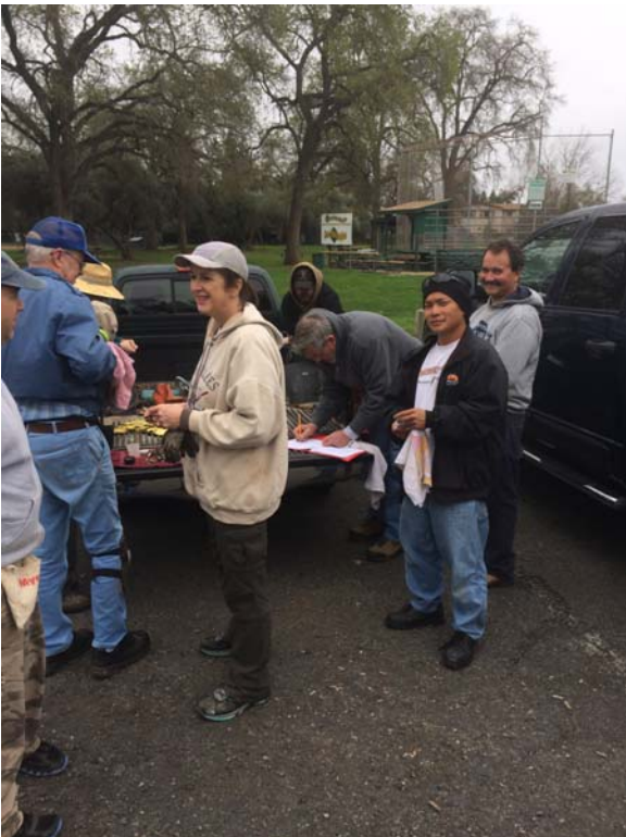
Wrapping up the Sunday Hunt