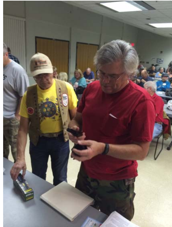
Checking out the TRX