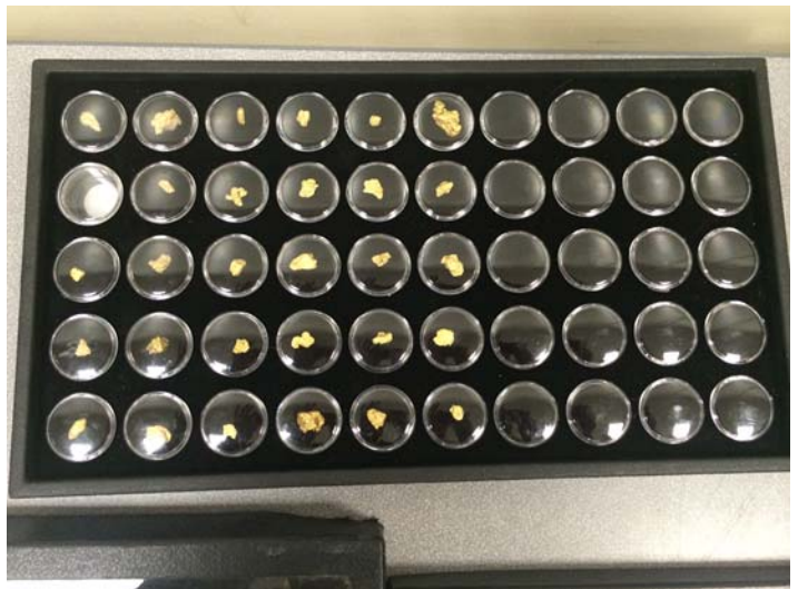
Some smaller gold finds