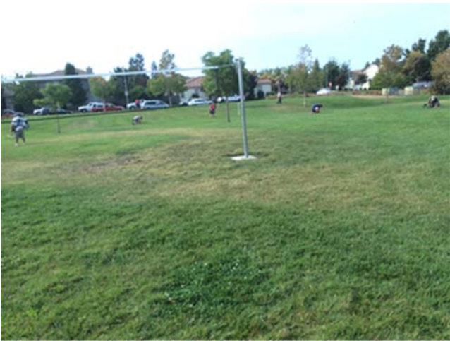
Outstanding in their field