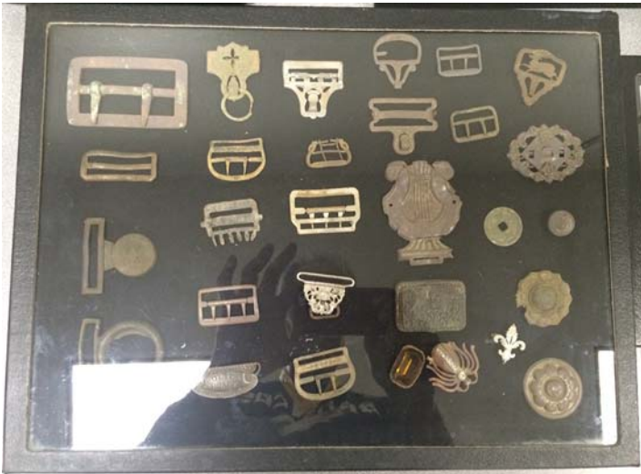
Some of Ron's relics