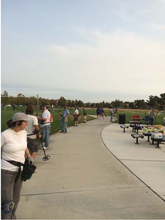
Waiting for the "Go" signal