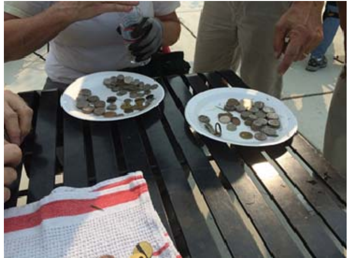
Looking for tokens after the hunt