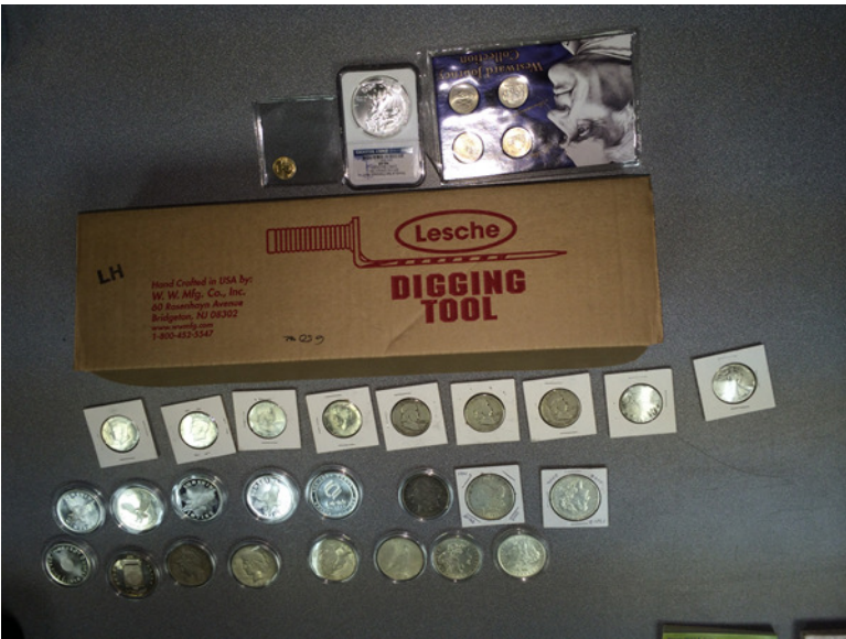
The bounty for the night