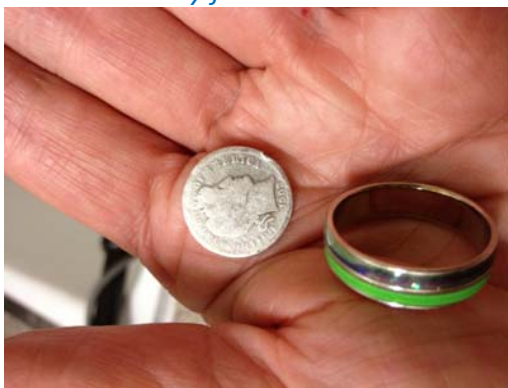
Bounty from the Earth