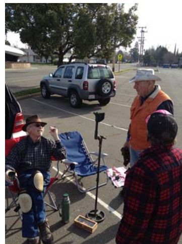
A motley crew