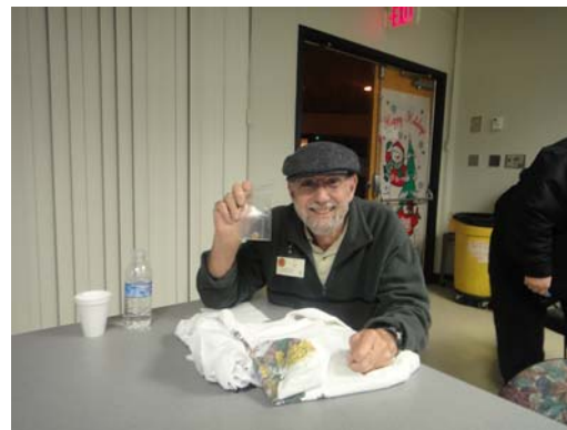
A happy winner