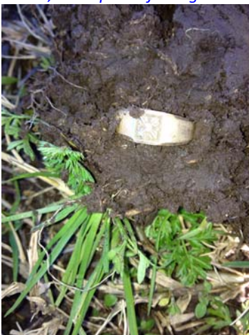
Oh, that special feeling