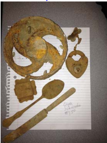
It's a dirty business