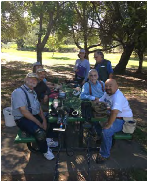
Sacramento Valley Detecting Buffs

The Usual Suspects Keeping Our Parks Clean