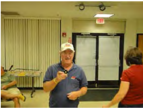
DD Riggs Gold Coin Winner