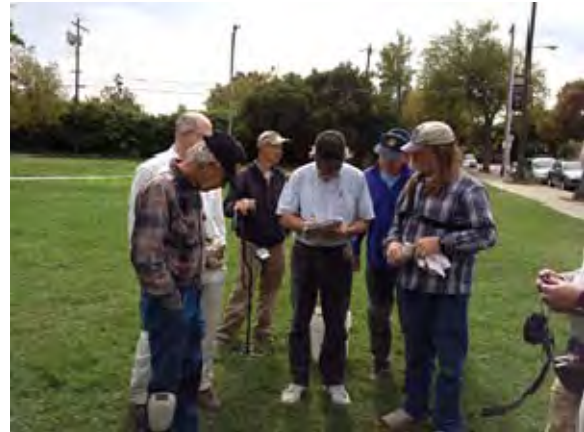
Praying for some good finds.