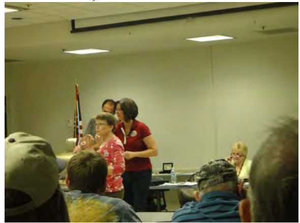
Busy Raffle Action